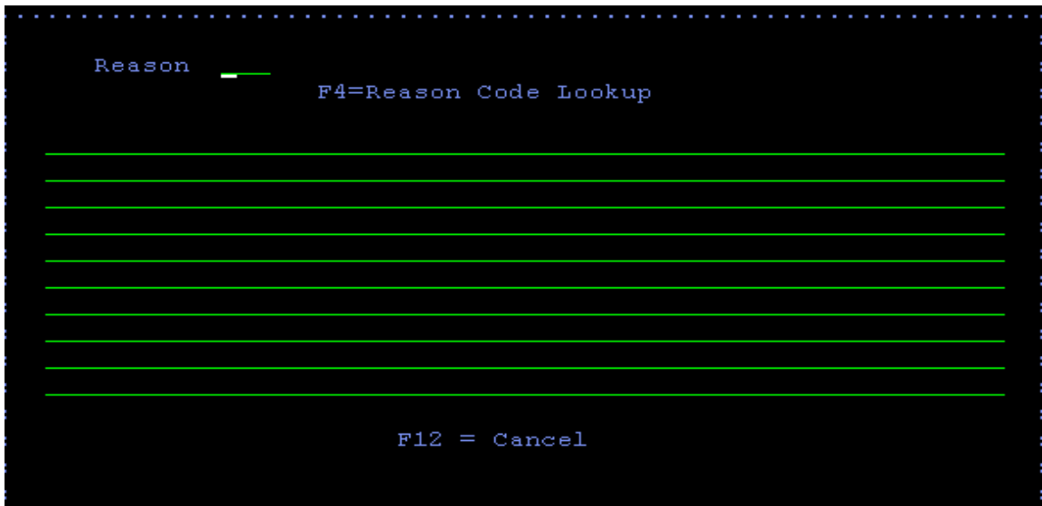
Fig: Screen to enter multiple lines of text