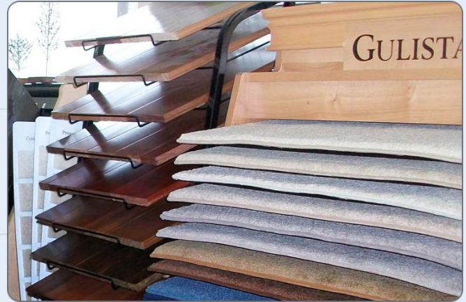
Fine Carpets Since 1924